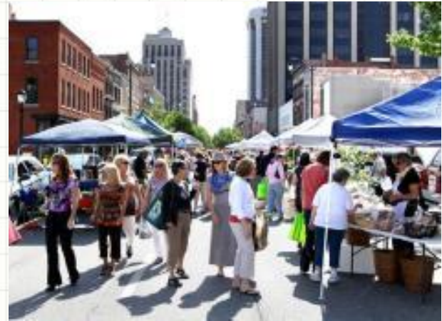
Old Capitol Farmers Market, Springfield