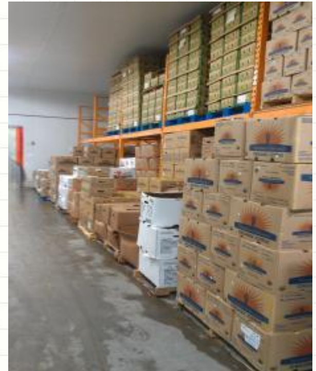
Goodness Greenness packaging equipment and storage