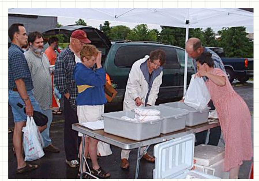
Organic Pastures Meat CSA, Eureka, IL