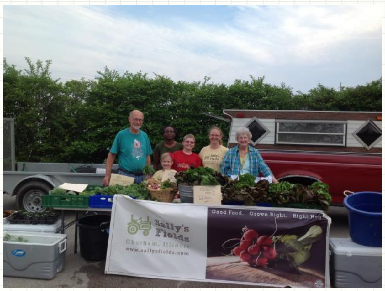
Sally's Fields CSA, Chatham, IL