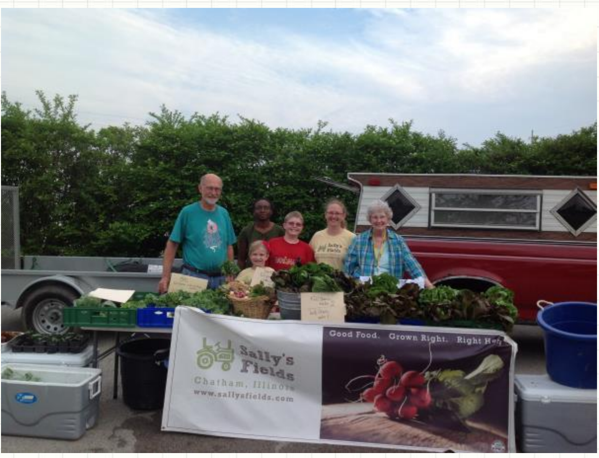
Sally's Fields CSA, Chatham, IL