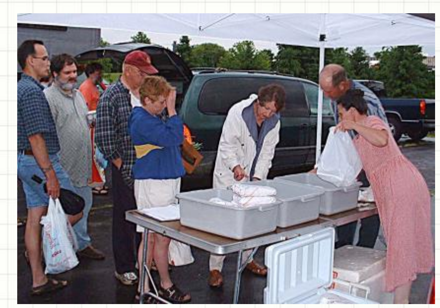
Organic Pastures Meat CSA, Eureka, IL